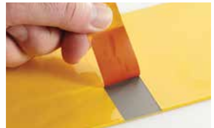
Clean removal, sharp paint edges up to 500°F/260°C

Temperatures are going up in powdercoat paint operations, and many masking tapes can no longer take the heat. That's why 3M, the leader in masking tape technology, has developed 3M™ Polyimide Tapes 8997 and 8998. Specifically developed for today's higher temp powdercoat paint applications, 3M™ Polyimide Tapes are engineered to leave sharp, clean edges—even after paint bake applications up to 500°F/260°C.