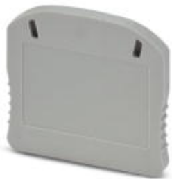
End cover, length: 19.9 mm, width: 2.2 mm, height: 17.7 mm, color: gray

Please be informed that the data shown in this PDF Document is generated from our Online Catalog. Please find the complete data in the user's documentation. Our General Terms of Use for Downloads are valid ( http://phoenixcontact.com/download )