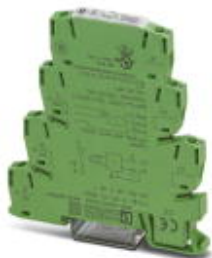
Timer relay with off delay (with control contact) and an adjustable time range (0.3 min - 30 min), with screw connection

Please be informed that the data shown in this PDF Document is generated from our Online Catalog. Please find the complete data in the user's documentation. Our General Terms of Use for Downloads are valid ( http://phoenixcontact.com/download )