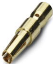
Crimp contact, turned, contact diameter: 1.5 mm, crimp range: 0.5 mm 2 ... 1 mm 2

Please be informed that the data shown in this PDF Document is generated from our Online Catalog. Please find the complete data in the user's documentation. Our General Terms of Use for Downloads are valid ( http://phoenixcontact.com/download )