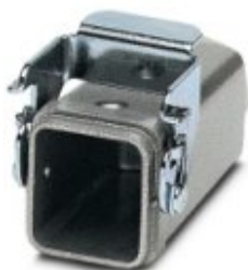
Coupling housing, with single locking latch, height 61 mm, without screw connection, 1 x Pg11, zinc die-cast

Please be informed that the data shown in this PDF Document is generated from our Online Catalog. Please find the complete data in the user's documentation. Our General Terms of Use for Downloads are valid ( http://phoenixcontact.com/download )