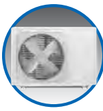
Small Air Conditioners