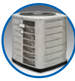
Large Air Conditioners