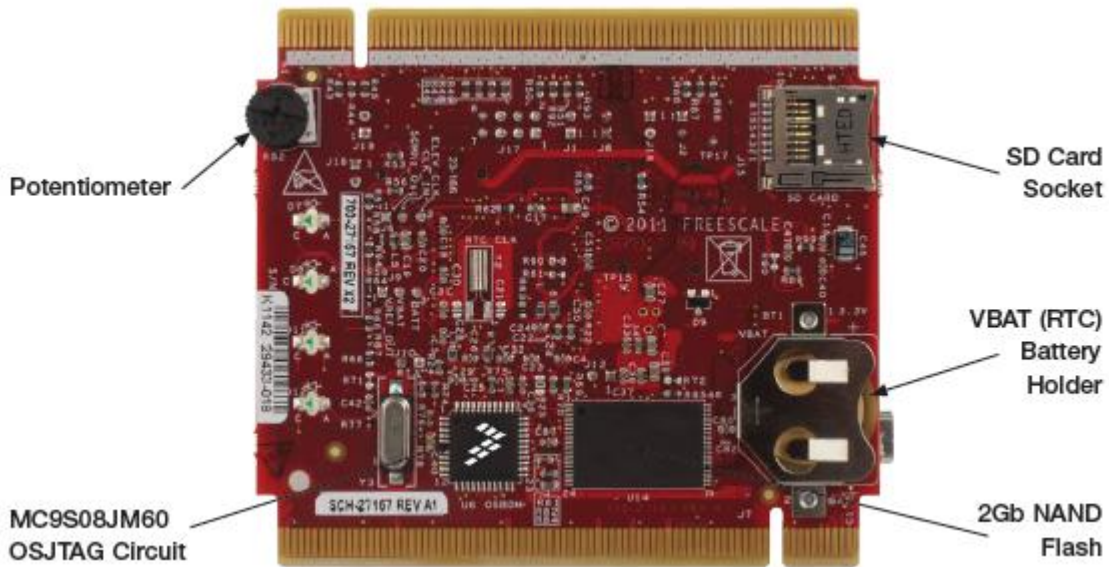
Figure 3. Callouts on back side of the TWR-K60F120M