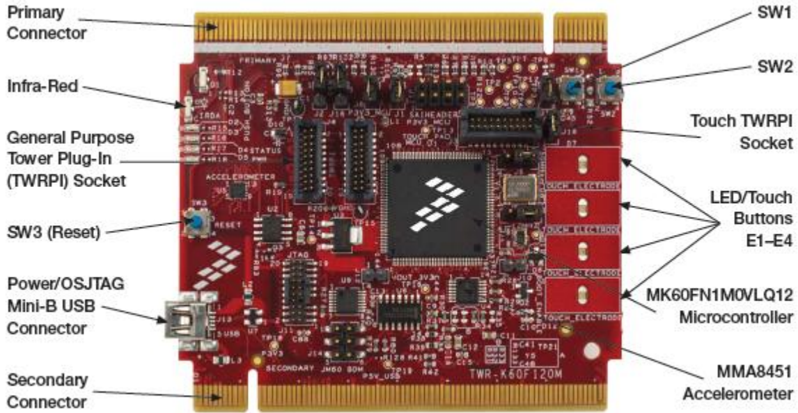
Figure 2. Callouts on front side of the TWR-K60F120M