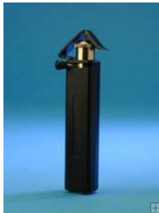
Round Cable Stripper

Die for Barrel Type Connectors 22-12 AWG Non Insulated