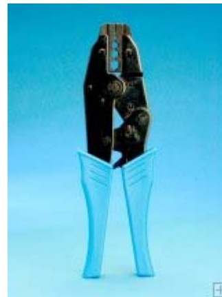
Crimping Tool Frame Only